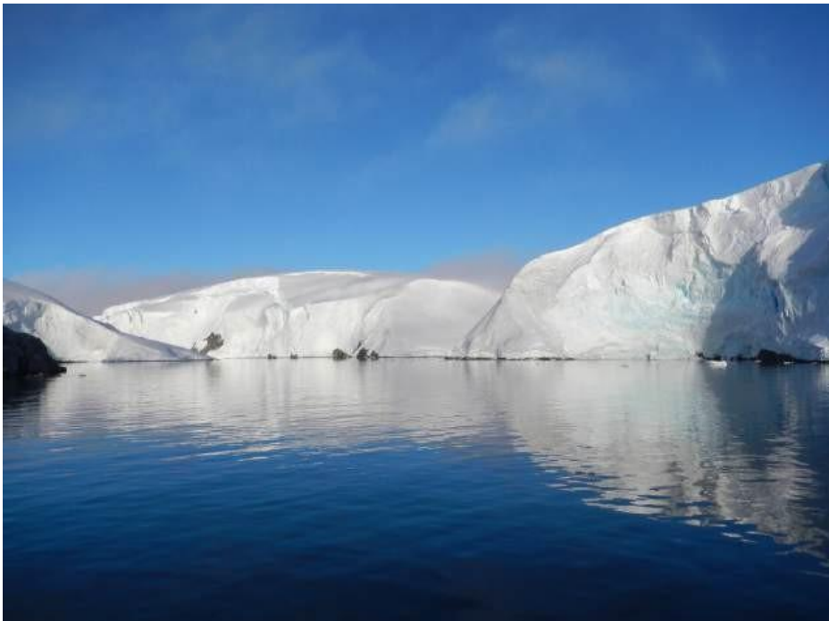
Eighth day, arrival on the Antarctic Peninsula and anchorage in Melchior Harbor for a well-deserved rest