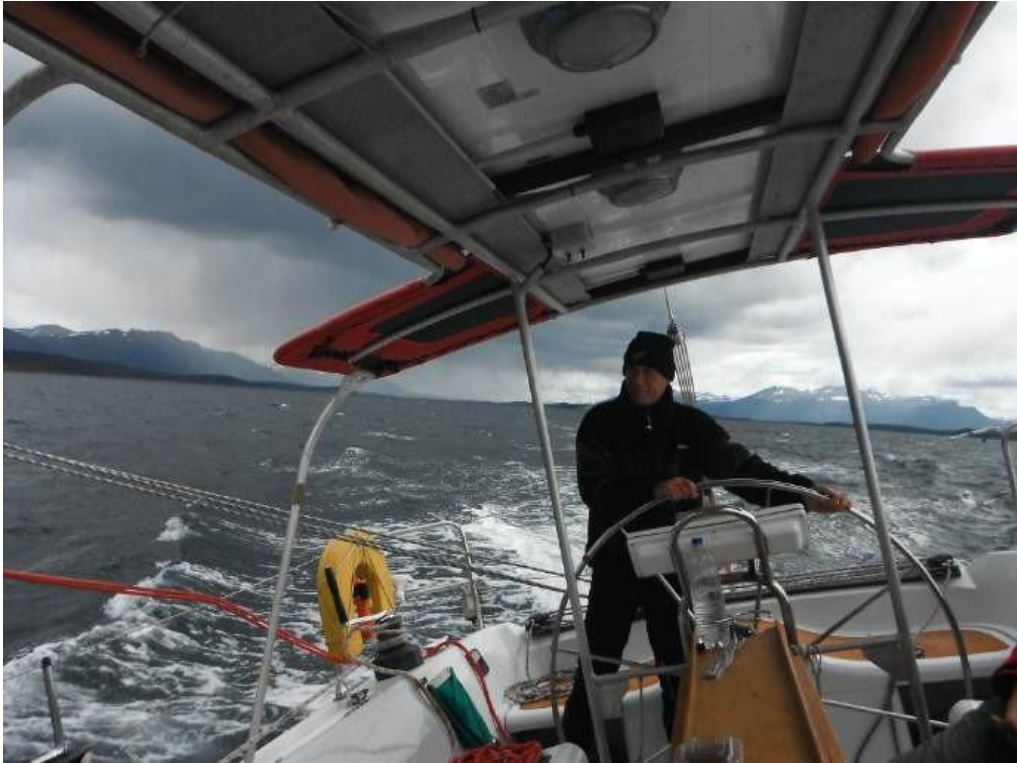
Fourth day, passage of Cape Horn and route to the Antarctic Peninsula (4 days at sea)