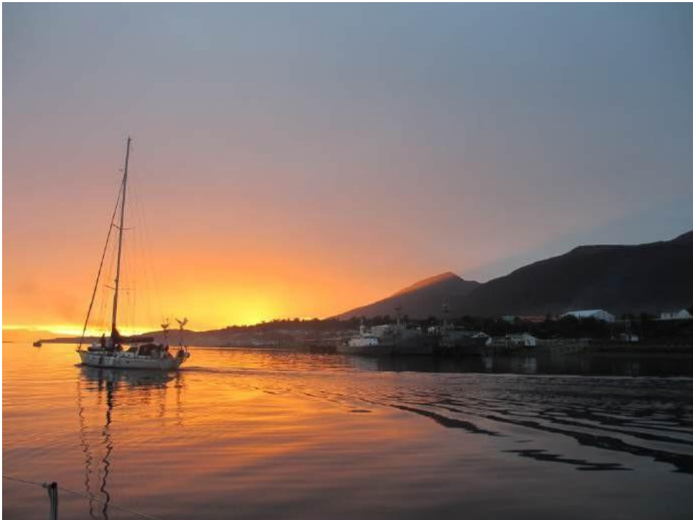
Twenty-ninth day, exit formalities from Chile to Puerto Williams